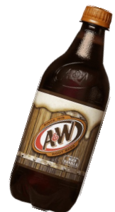
"Rooty" The Rootbeer Bear